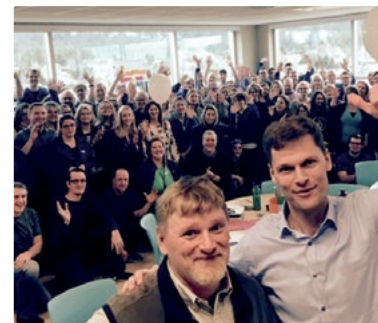
Post Falls, USA