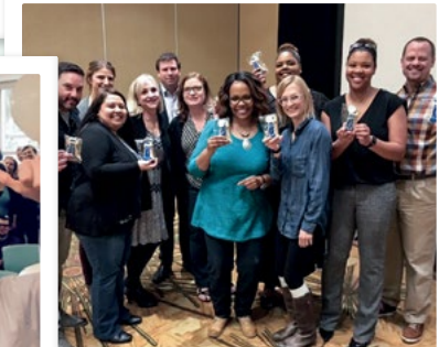
Round Rock, USA